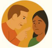
Emotional / Psychological abuse